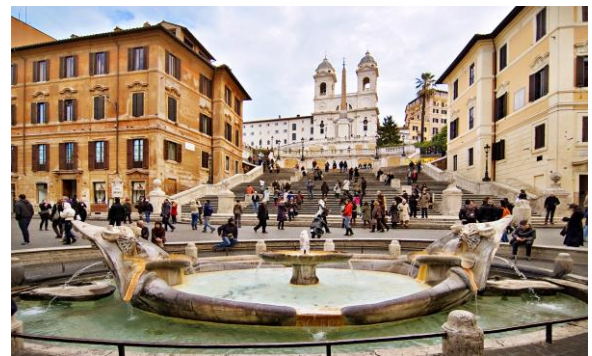
Piazza di Spagna

See Trinita dei Monti , a Roman Catholic late Renaissance Titular Church best known for the commanding position above the Spanish Steps.