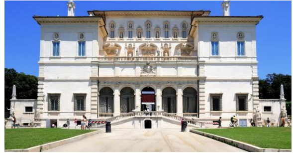
The Borghese Gallery

This magnificent temple of art was created by the wealthy Cardinal Scipione Borghese to house his renowned private collection, which included masterpieces by names such as Raffaello, Tiziano, Bernini and Caravaggio.