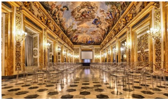
Medici Riccardi Palace

Head towards Straw Market and the picturesque shop-lined bridge, Il Ponte Vecchio , which is famous for its selection of gold and silver.